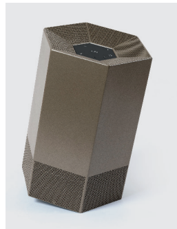
Bronze REF. 8 77 2127-BR