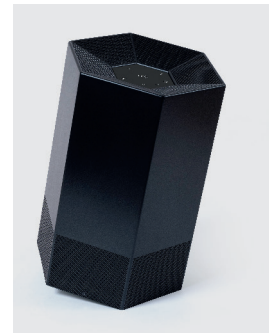
Matte black REF. 8 77 2127-BK