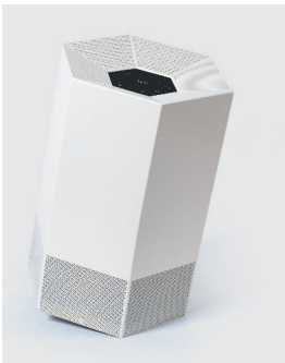
Cream white REF. 8 77 2127-WH