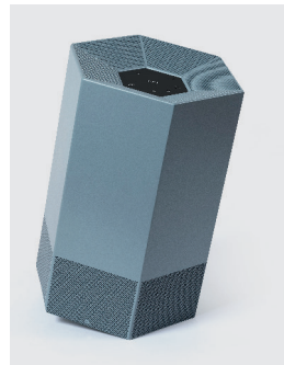
Sapphire blue REF. 8 77 2127-BL